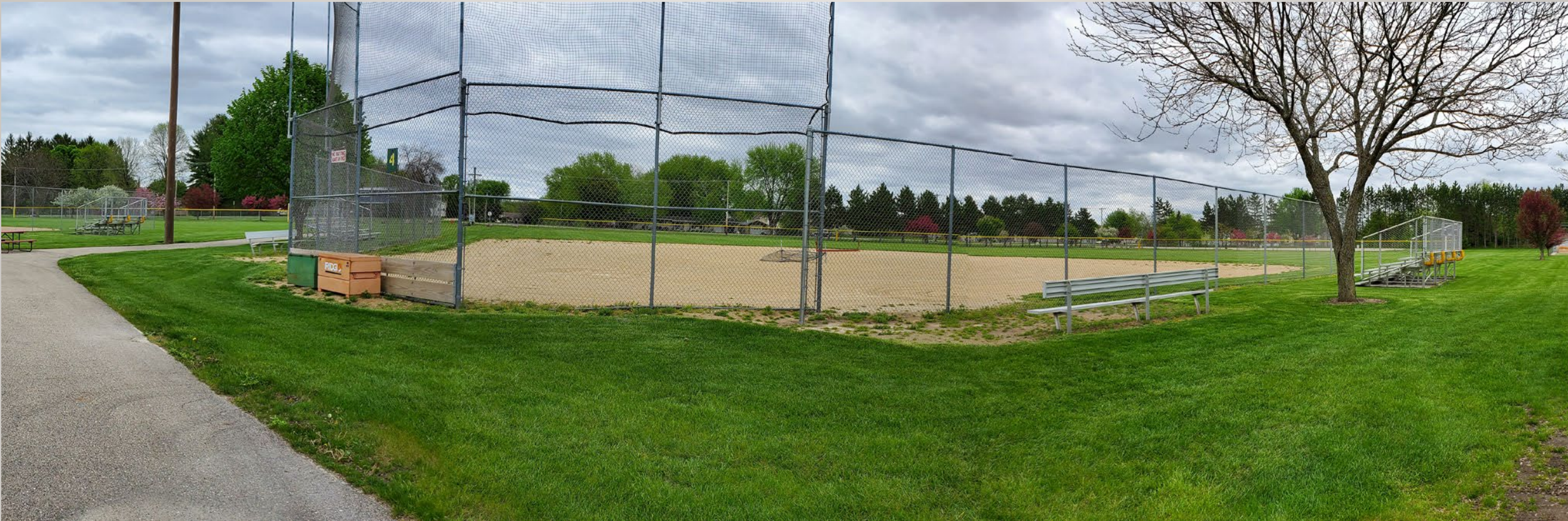
Current Existing Condition