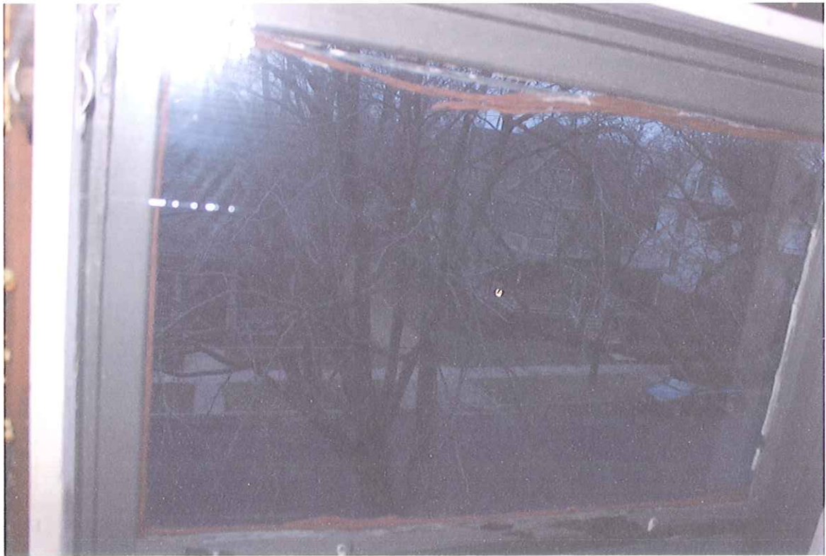
South window interior close-up