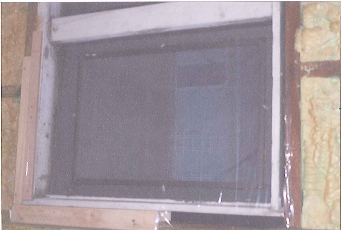
North Window Interior (Left side)