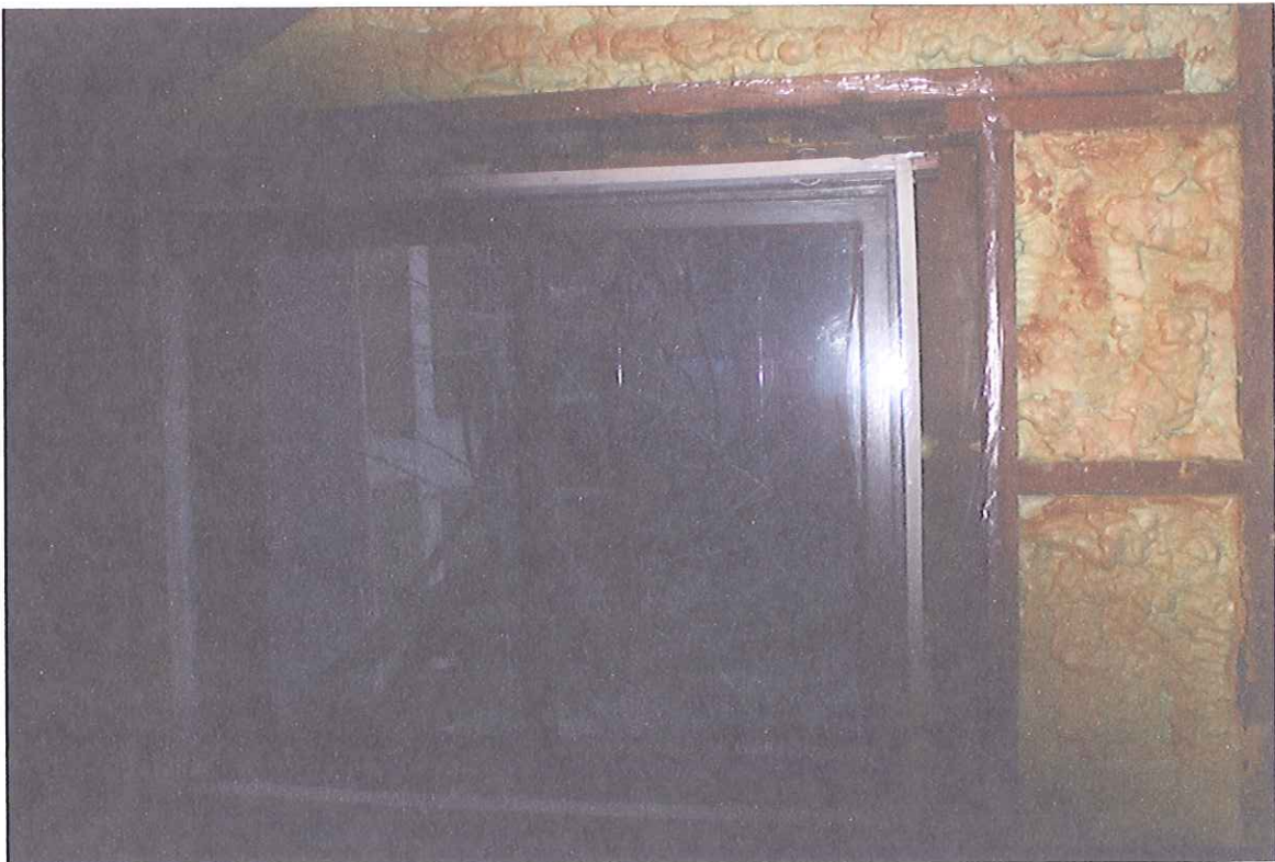
South Window Interior