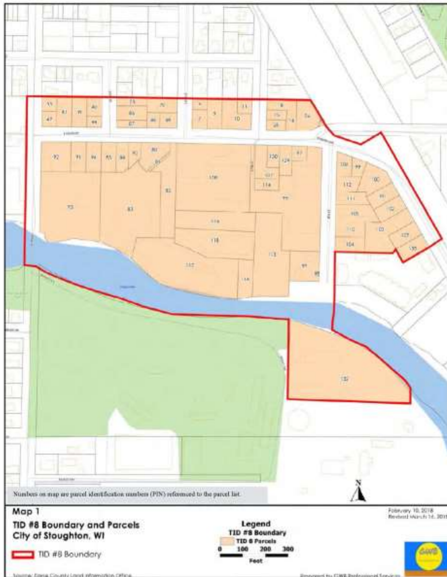
Map #1: TID #8 Boundary and Parcels