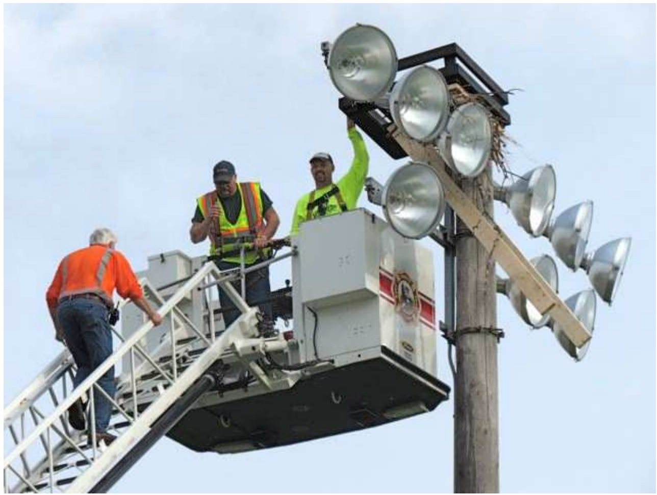
Rick to the rescue!